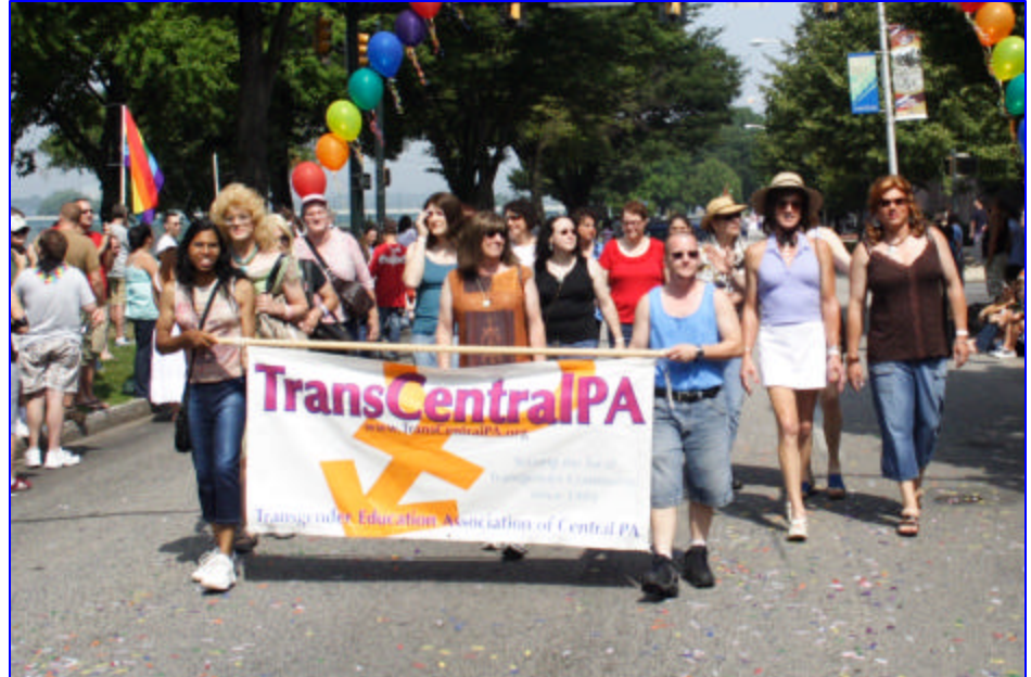
TransCentralPA marching in the Central Pennsylvania Pride Festival Parade on Saturday, July 25th

2009 Southern Comfort Conference , Sep 22-27 in Atlanta, GA. SCC is the largest transgender conference in the country. Visit www.sccatl.org